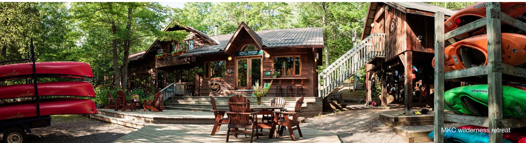
MKC wilderness retreat

Off-the-grid Cabanas tucked in the woods, based on double occupancy with either a Queen Bed, or 2 Twin Beds. Washroom facilities are a short walk away.